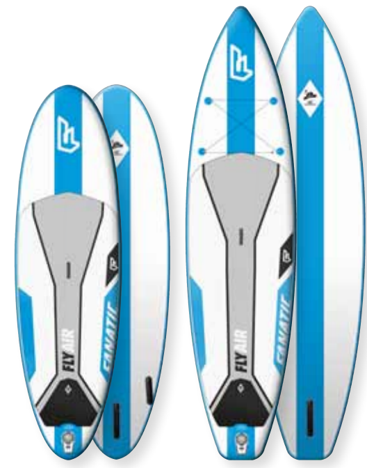
FLY AIR 9'0"/10'0"/10'6"/10'8"

It's time to blow up. The Fly Air is the ultimate inflatable Funboard. Inspired by our outstanding Fly range of traditional SUP boards, it features a stretched longboard-style outline combined with plenty of volume. The smaller sizes have customizable fin options to help you rip up swell or simply improve maneuverability. For 2014, we'll also introduce two new sizes – the 10'8" and the 10'0" to bridge the gap between 9'0" and 10'6". Meet the Fly Air Touring board, the inflatable version of our Ray cruiser. Exploration, longer paddle sessions, or even multi-day SUP tours are all easy with this multi-use inflatable SUP. The Fly Air Touring models – in both Stringer Technology construction and our Premium Edition Double Layer Technology – will offer a handy deck net that lets you pack a picnic for a lakeside lunch. You can go anywhere with the Fly Touring board.