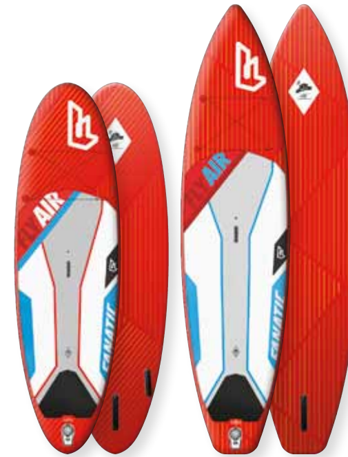
FLY AIR PREMIUM 9'0"/10'0"/10'6"/10'8"