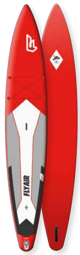
FLY AIR RACE 14'0" x 29"

Want to race – but don't want the hassle of a hauling around fourteen feet of rigid board? You need the Fanatic Fly Air Race. In both full-size 14'0" and BOP-ready 12'6", the Fanatic Fly Air Race Inflatables are among the first race-ready inflatable boards on the market today. To make sure you're on the perfect race board for you, both are available in two different volumes, (274 and 300 liters for the 12'6", 314 and 345 liters for the 14'0") for a total of four boards ready to paddle to the first place at the finish line.